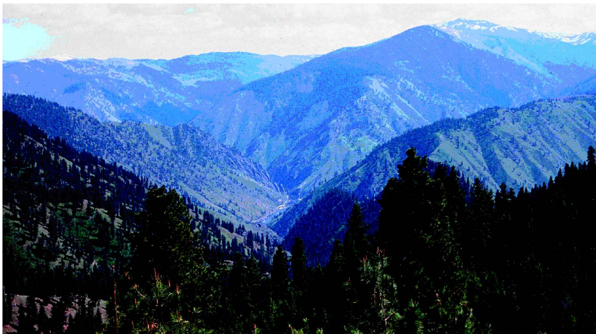
Figure 1. The Salmon River within the large wilderness core of Idaho. The few remaining relatively pristine landscapes worldwide will become increasingly important for testing hypotheses at the frontiers of ecology. These unfragmented landscapes are our only way of testing hypotheses on the dynamics and trajectories of ecosystem and evolutionary processes acting on extant species over long time scales and across broad geographic areas.

dynamics of ecological processes. Traditional definitions of species and traditional metrics of distribution and abundance often make a poor fit with the structure of microbial populations and communities.