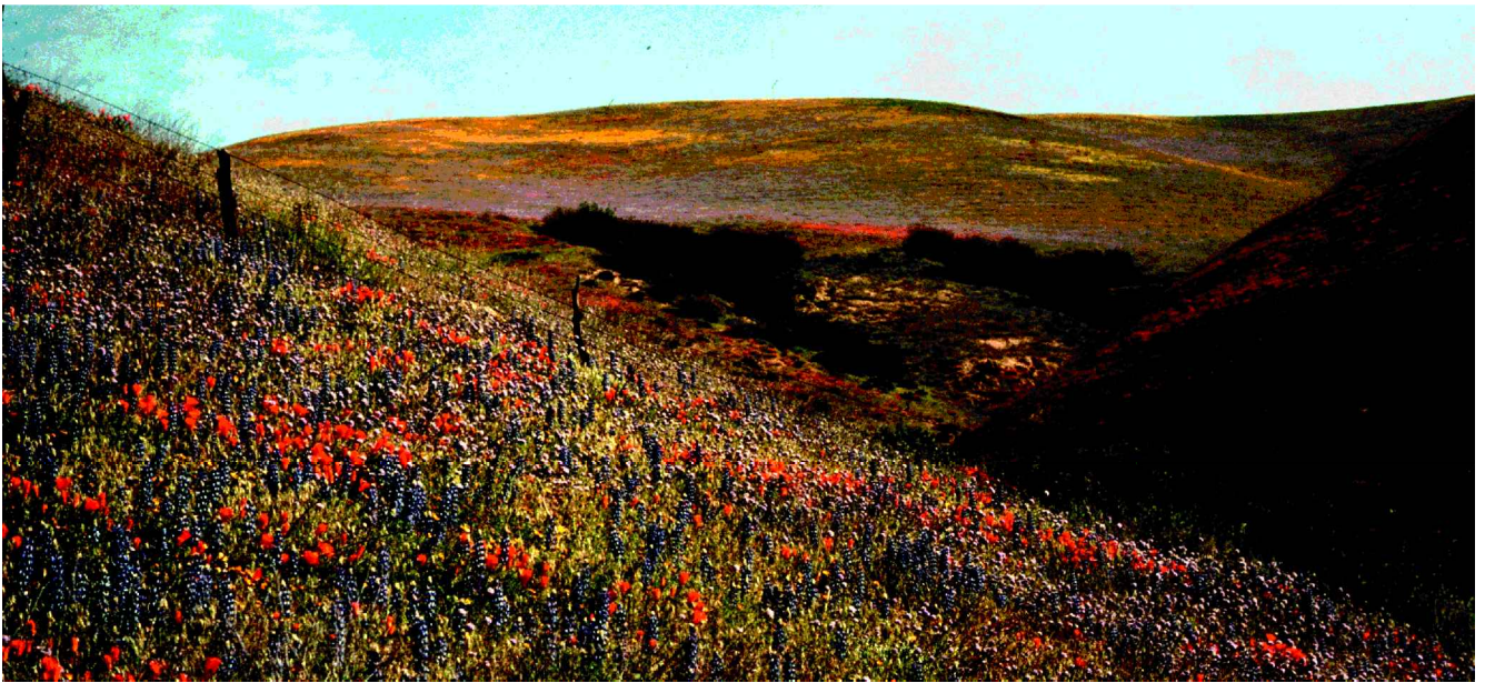
Figure 3. Coalescence of a new, complex plant community of native and introduced species at Tejon Pass, California. The community includes a mix of annual Mediterranean grass species and a diverse array of native annual wildflowers. Before invasion by the introduced grasses, the community was probably dominated by perennial, tussock-forming grasses, along with annual grasses and forbs.