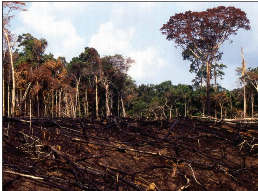
Figure 3. The clearing and burning of tropical forests – here seen in Novo Airão, Brazil – produces large C emissions to the atmosphere.

Higher CO 2 levels might be expected to increase tropical forest productivity through commonly seen plant responses such as increased photosynthesis and water-use efficiency. Surprisingly, however, in the more realistic experiments where tropical plants have been exposed to elevated CO 2 (plant “communities” in growth chambers,